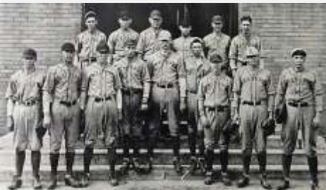
1924 State Champions