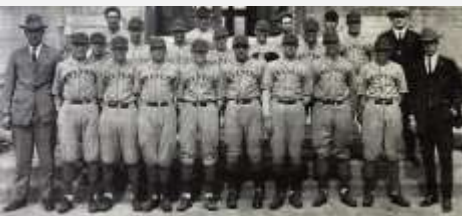
1923 State Champions