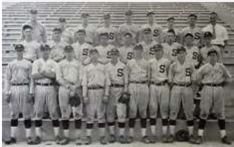
1928 State Champions

* Commercial HS declared ineligible and State Rally replayed in Natchitoches in May