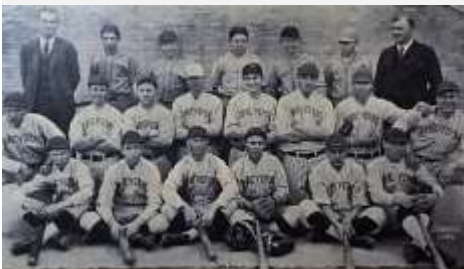
1925 State Champions