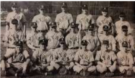
1956 State Champions