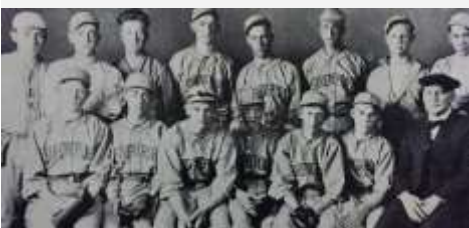
1920 State Champions