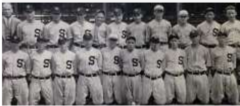
1927 State Champions