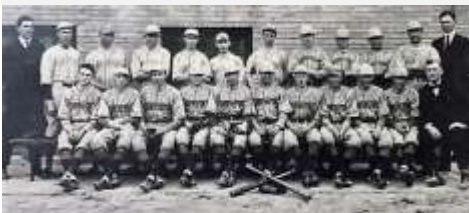
1922 State Champions