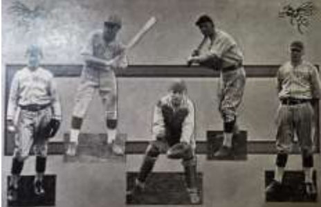
1926 State Champions