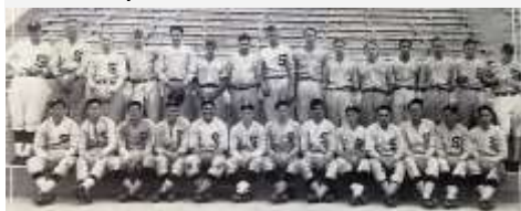
1930 State Champions